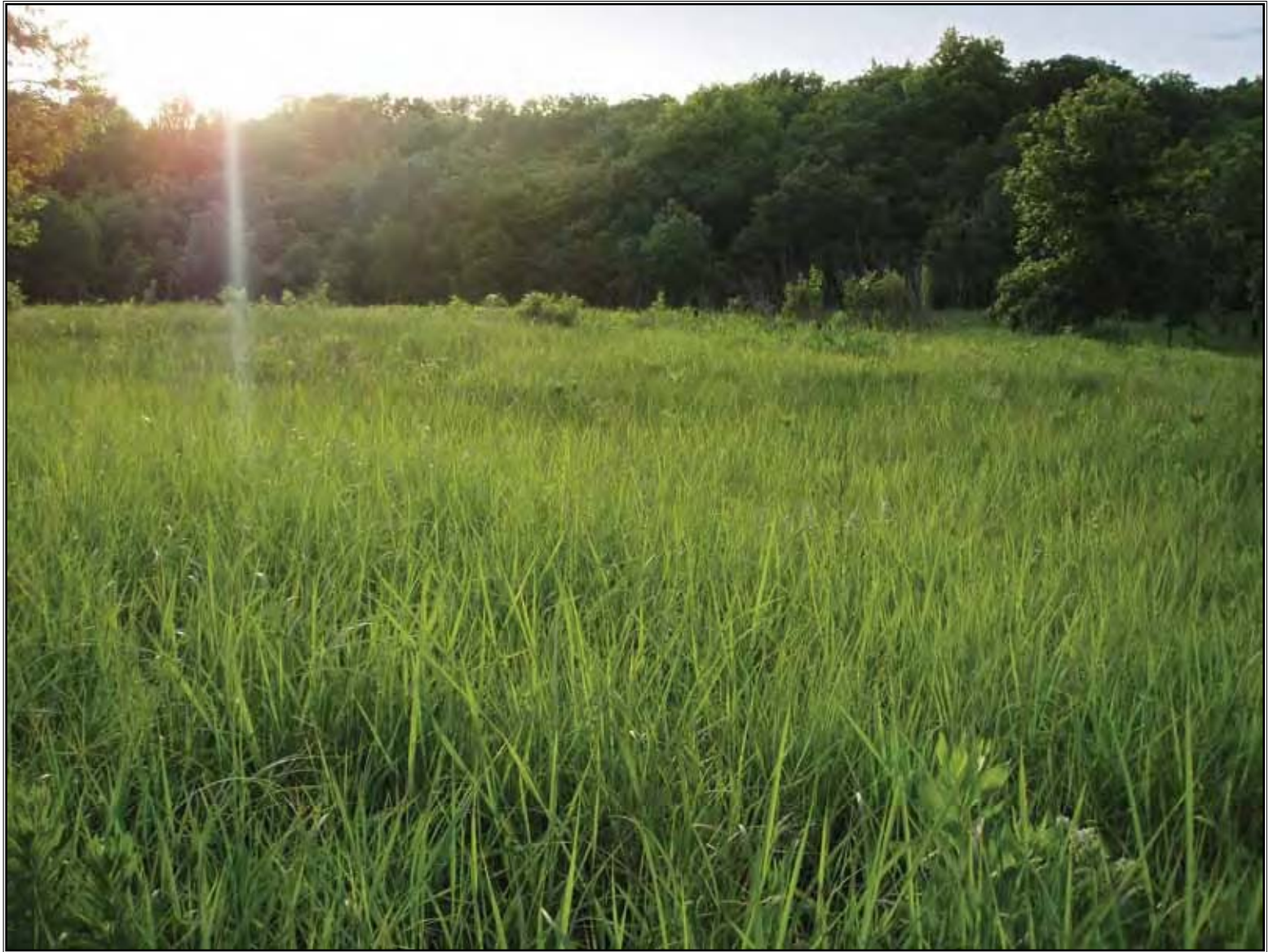
The late glow of the evening sun washes over the lush Spring grass of the tallgrass prairie