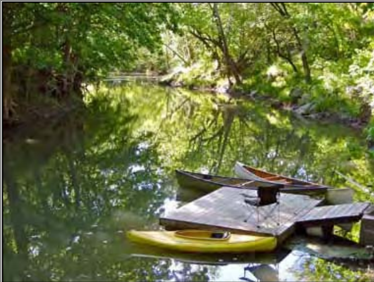
Fishing, canoeing, and kayaking on the cool waters of Wildcat Creek and Walnut Pond.