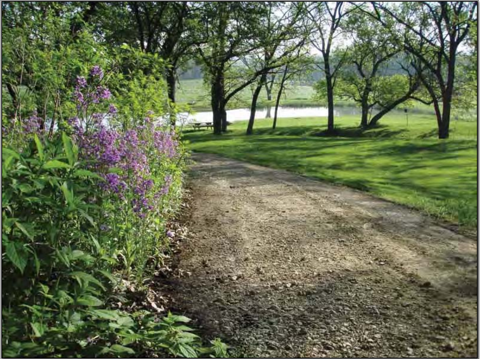
Spring flowers line the path leading to the picnic area of Walnut Pond