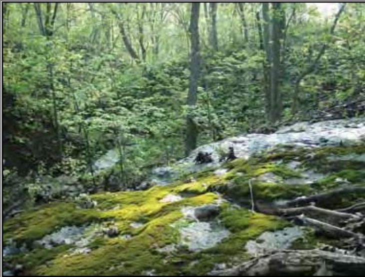
New grass emerges after its winter dormancy, and moss clings to a limestone outcropping. Blue Wild Indigo bravely emerges after a Spring burn.