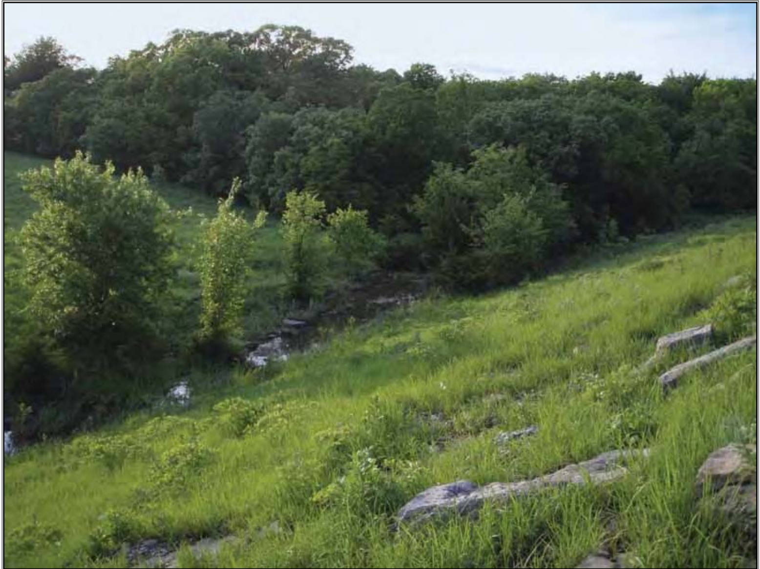
Clear water from a Spring rain flows through the grass before dropping into a wooded ravine.