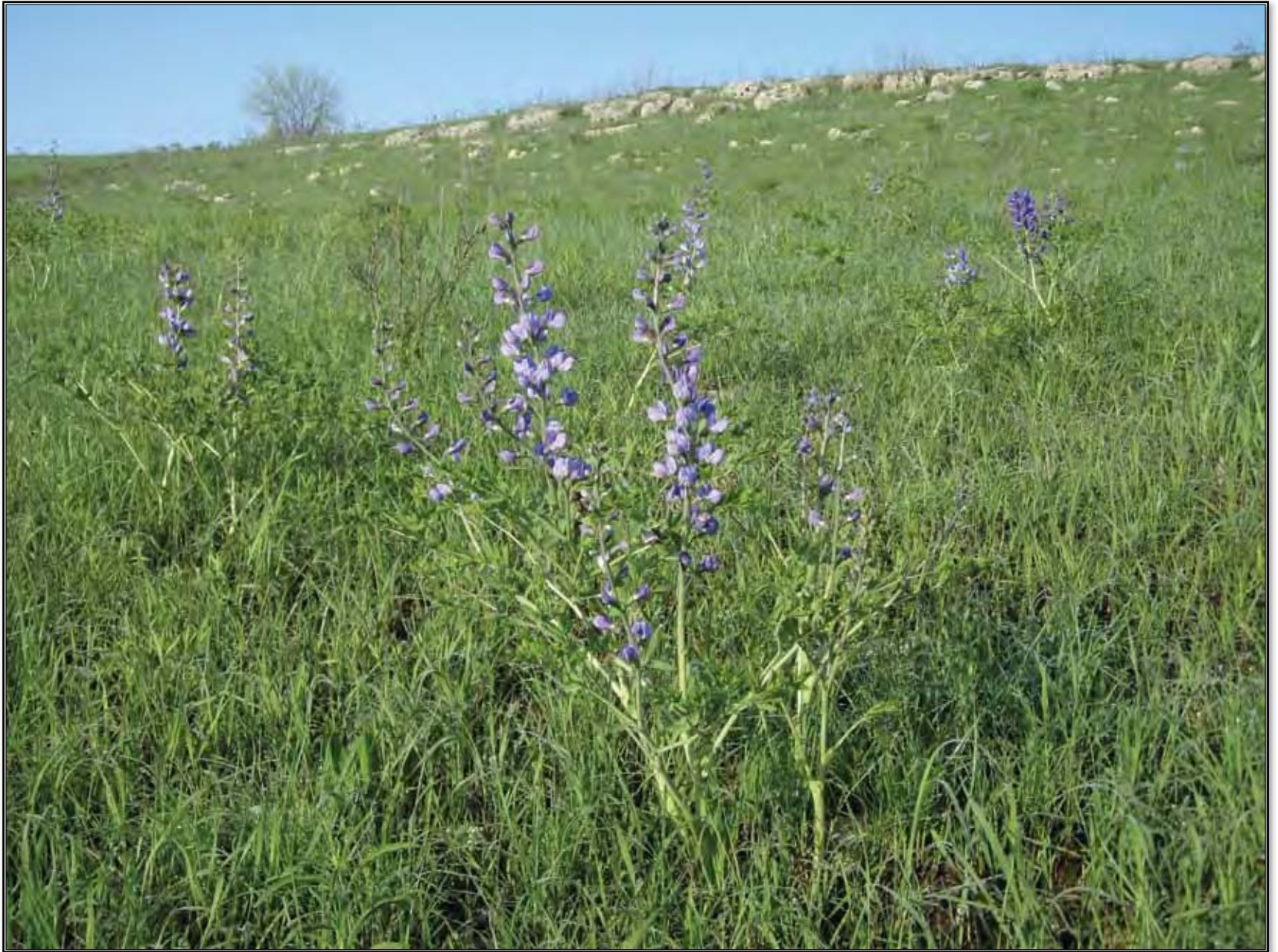
Blue Wild Indigo blooms amidst the new grasses emerging shortly after a Spring burn.