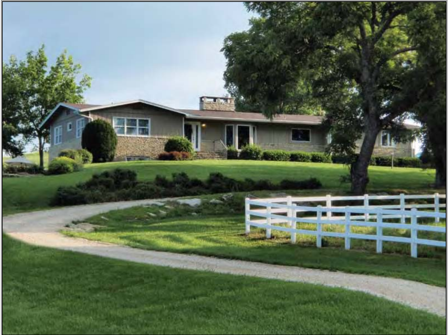
A winding drive leads past the Horse Pasture to the Ranch House.