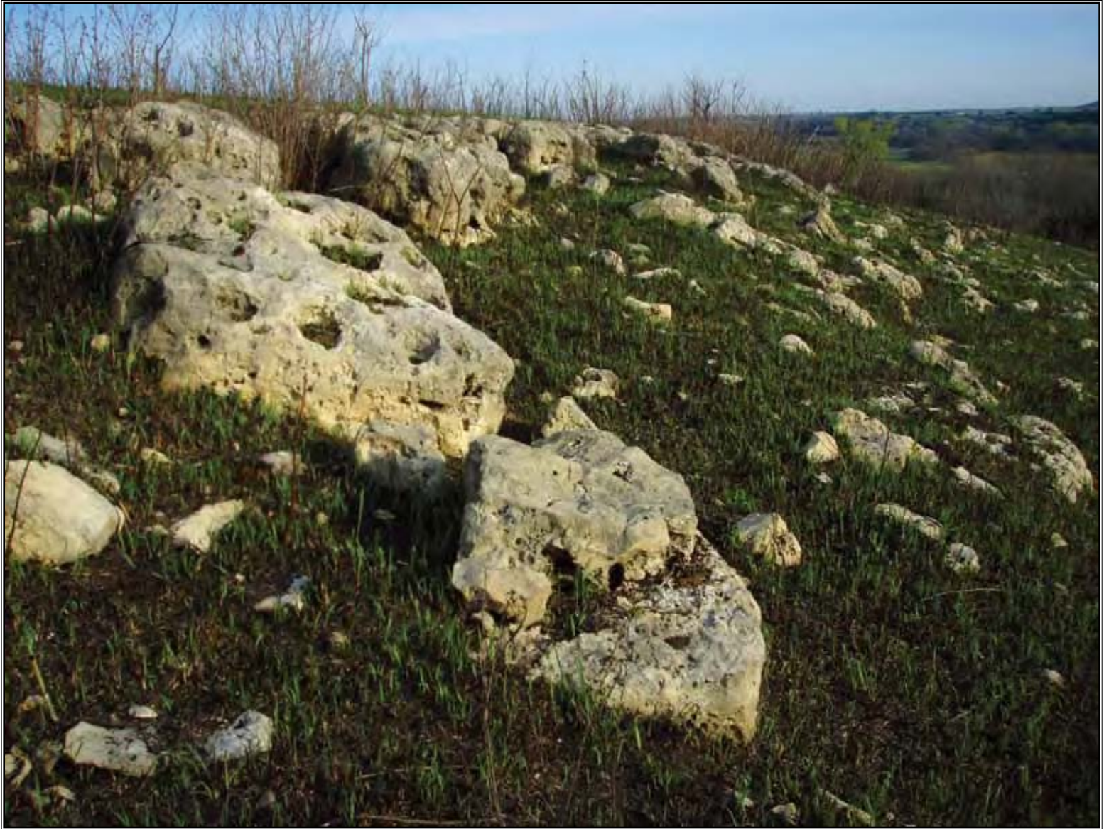
The rugged limestone outcroppings of the Flint Hills defied early attempts to plow the prairie under.