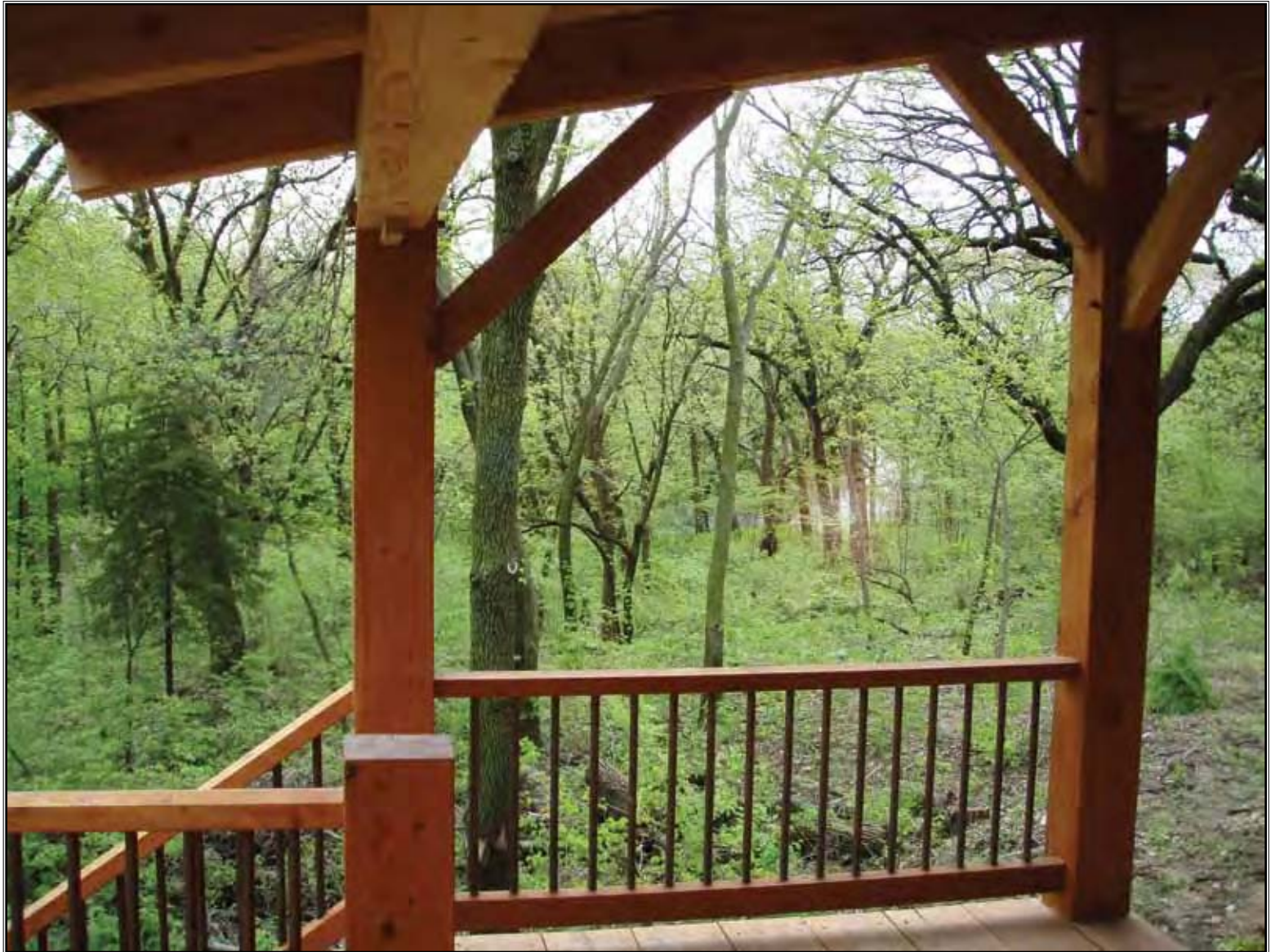
Early Spring arrives in the wooded valley of Wildcat Creek.