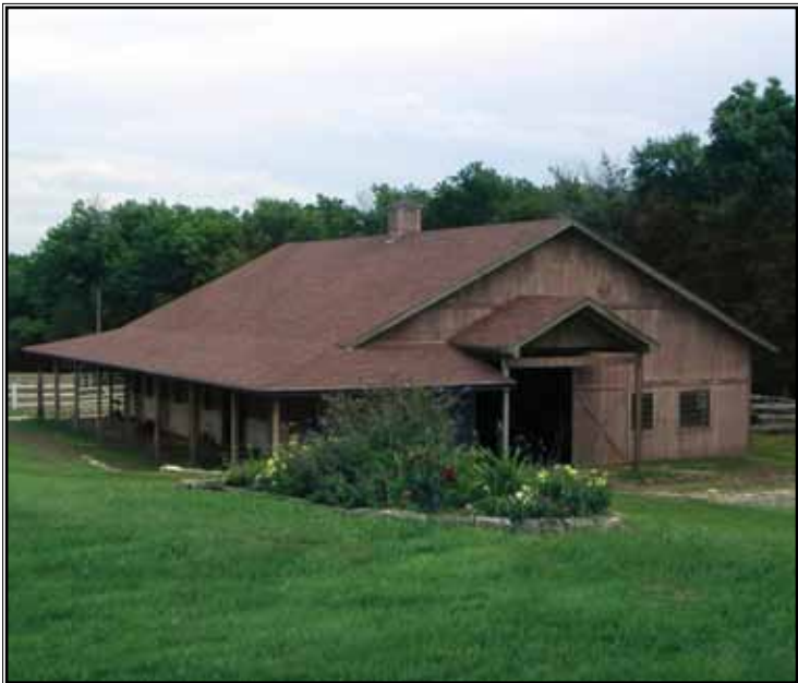
The 1929 Chevy farm truck, working horse barn, and canoe dock on Wildcat Creek are just some of the one-of-a-kind attractions that make Prairiewood so special.