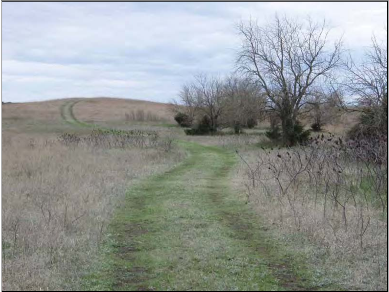
The first growth of Spring greets the cool weather of early March.