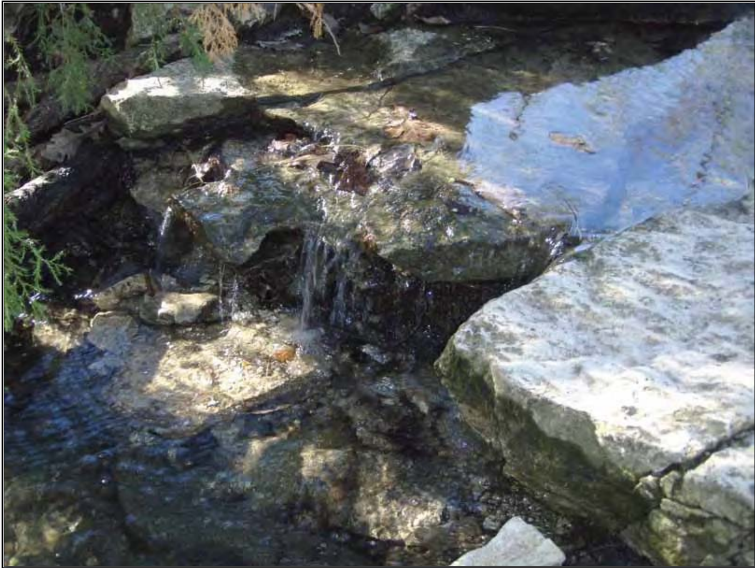
Clear, cool Spring water trickles over the limestone bedrock of Hidden Creek.